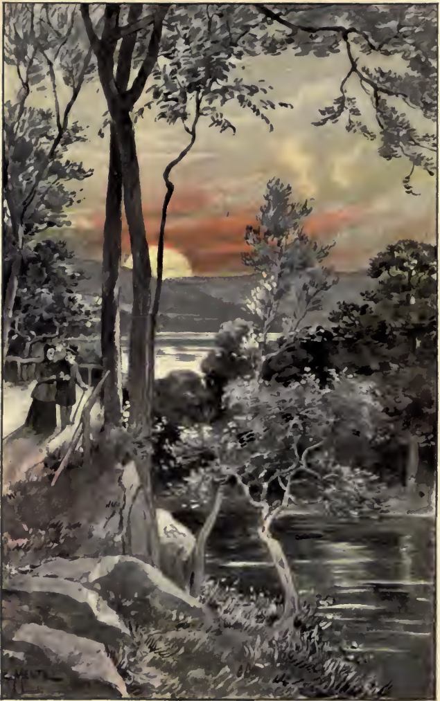
“The earth is full of the glory of the Lord”